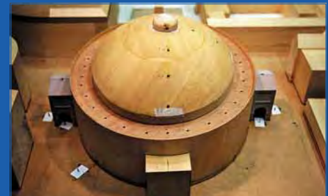
Wind tunnel scale model