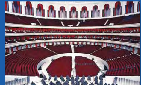
Acoustic scale model 1:12

In these studies, over 60 variations of the hall's interior were assessed, including an acoustically reflecting and diffusing convex velarium and a number of arrangements of scattering and diffusely reflecting free hanging elements in the transition area between the lower auditorium and the dome. The latter solution turned out to be optimal. An array was proposed, more condensed and more central in the space than the array designed by Shearer in the late 60s, which resulted in a significant improvement. Other design work, applying Computational Fluid Dynamic calculations, was carried out for the new ventilation system, which combines the mechanical supply of conditioned air with a natural air extract system, based on the stack effect. Wind tunnel tests gave information about the air pressures near the natural ventilation exhausts. Air supply was fully integrated in the steps of the stall areas and optimised for air flow and acoustic performance in the Peutz laboratories.